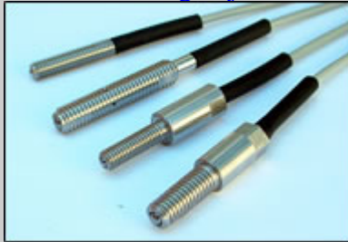
Ball plunger with built-in sensors