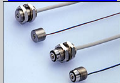
Stopper Mini with built-in sensors

\phi 8 \times 8 Perfect fit for robots' fingers detecting clamping signals.