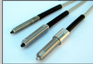
Spring plunger with built-in sensors