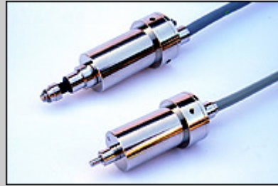
CS-Touch sensors CS-series

2 class discrimination sensor ( \pm NG OK)