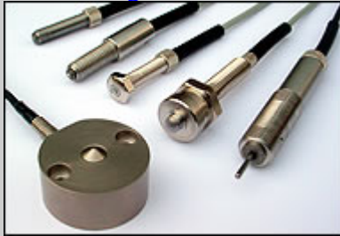
Stopper bolt with built-in sensors

Dog, stopper bolt and actuator are no longer needed.