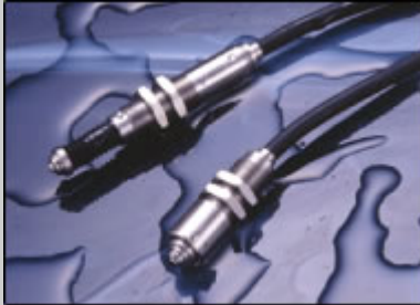
High precision MT-Touch sensors

0.5 micron repeatability without amplifier. Co-invented with TOYOTA Motor Corporation.