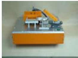
RF MODULE TESTING FIXTURE