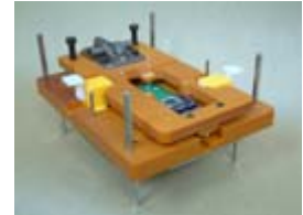
MOBILE PHONE TESTING FIXTURE