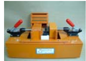
CONNECTOR TESTING FIXTURE