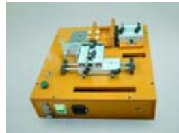
AIR PRESSURE TYPE TESTING FIXTURE