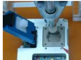
RF IC MODULE TESTING FIXTURE