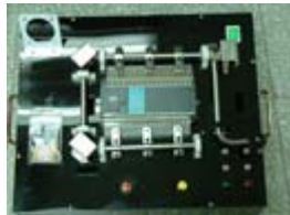
GEAR TYPE TESTING FIXTURE