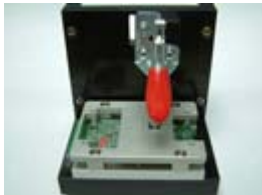
GPS TESTING FIXTURE