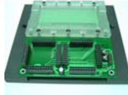
LCD TESTING FIXTURE