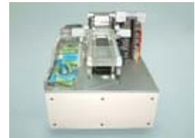
LI BATTERY TESTING FIXTURE

© 2007 Advfit Automation Sdn Bhd. All Right Reserved.