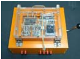
CAN TYPE TESTING FIXTURE