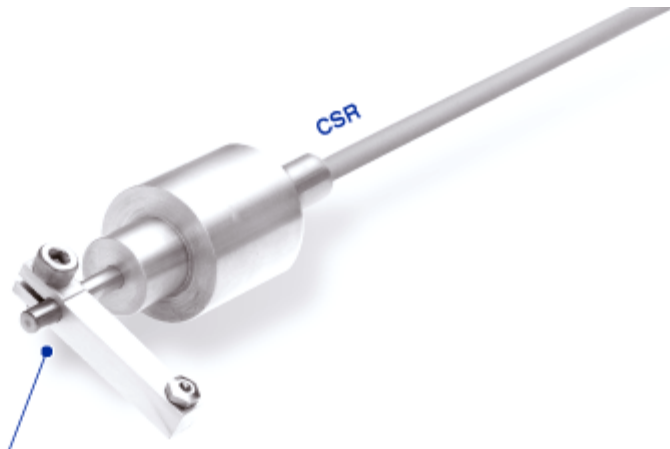
Rotating lever type